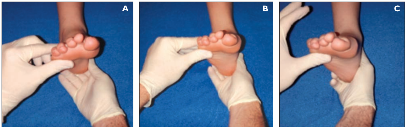
Figure 1: Clinical talotarsal joint range of motion evaluation. A. Neutral position. B. Normal pronation, <6 degrees. C. Excessive pronation >6 degrees.

joint instability. Soft tissues can compensate for these excessive forces for only a specific, limited time period. Eventually, a critical threshold is reached where the soft tissues are no longer able to handle the force. This is when soft tissue pathology/symptomatology begins. The soft tissue pathology will be nearly impossible to repair until the realignment and stability of the TTJ is achieved. The associated joints will also become diseased due to the chronic disease process.