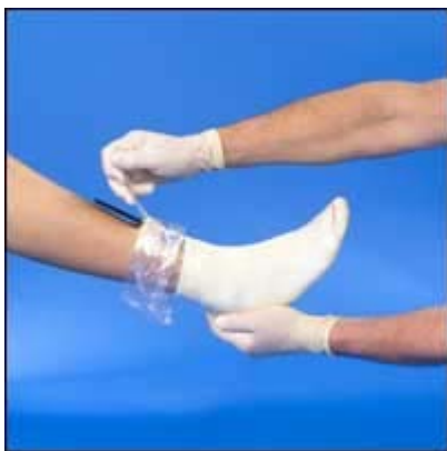
9. Cut sock with scissors or letter opener over cutting strip. Fig. 9